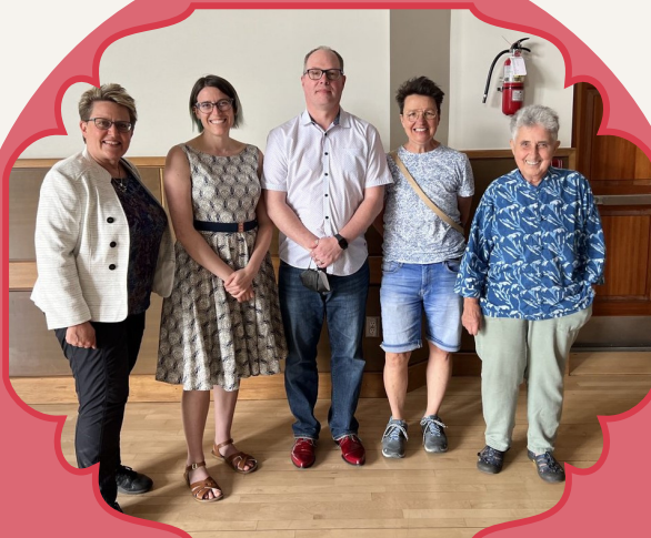
2022 DCA Annual Meeting speakers

The Dalhousie Community Association acknowledges that it is located on the traditional and unceded Algonquin Anishinaabe territory. As settlers, we recognize the Algonquins as the customary keepers and defenders of this land, and we honour their long history of welcoming many Nations to this beautiful territory.